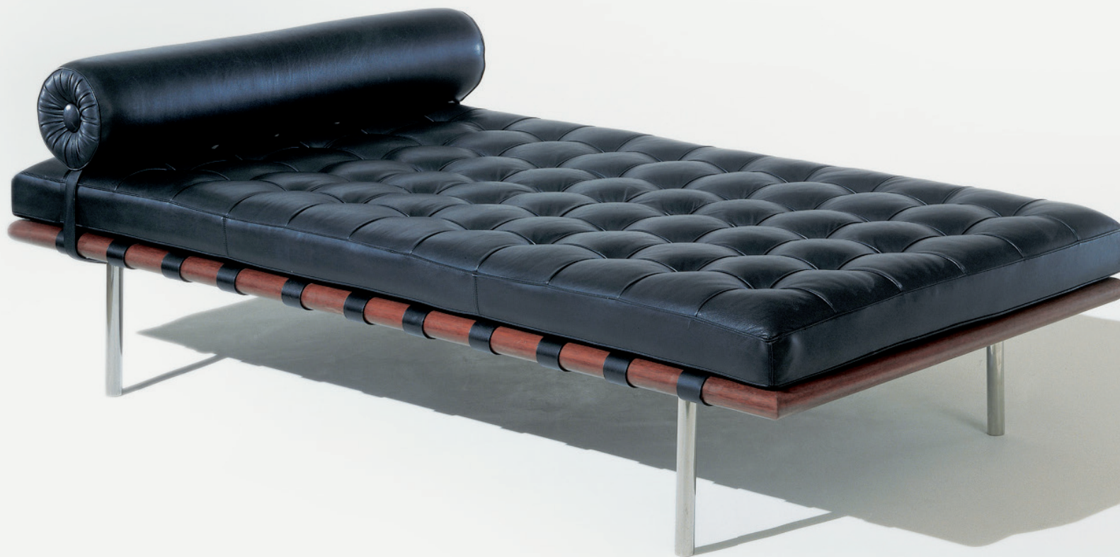
Barcelona® Daybed - Relax Ludwig Mies van der Rohe, 1967