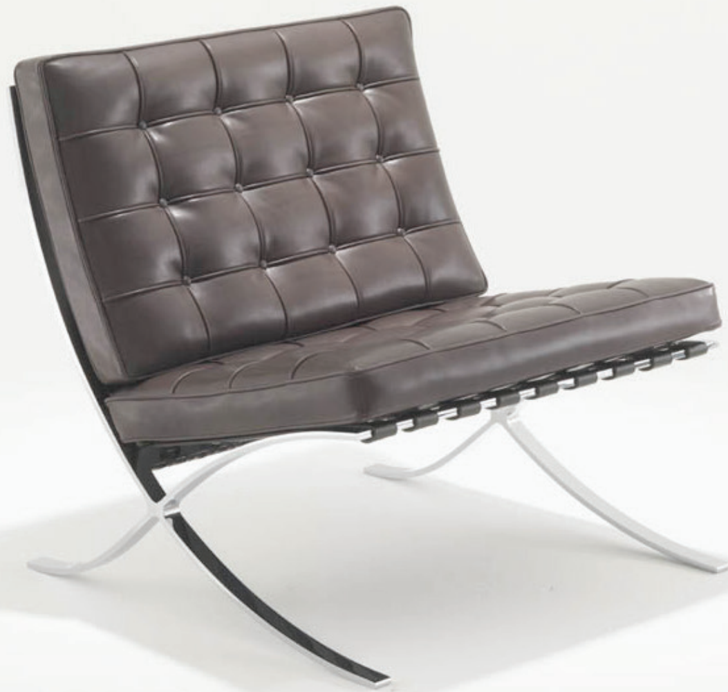
Barcelona® Chair - Relax Ludwig Mies van der Rohe