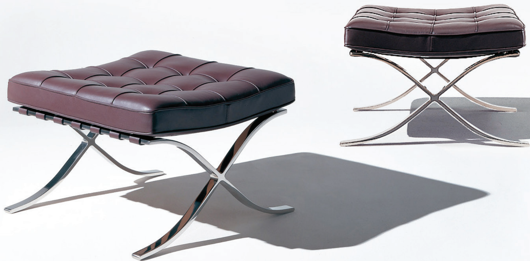
Barcelona® Ottaman - Relax Ludwig Mies van der Rohe, 1967