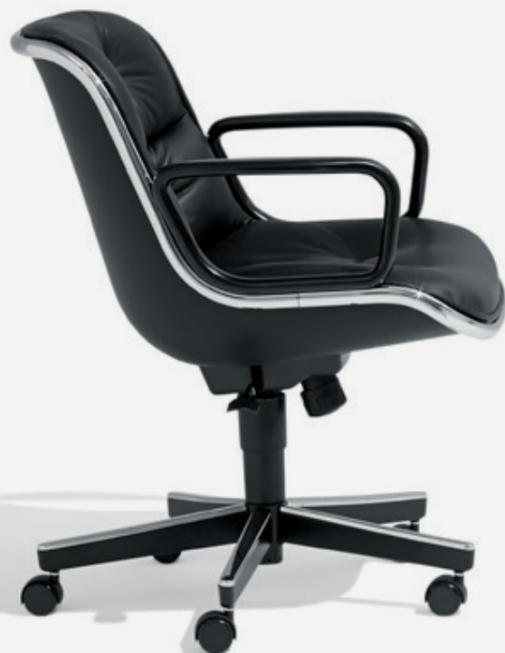
Pollock Arm Chair Charles Pollock, 1960